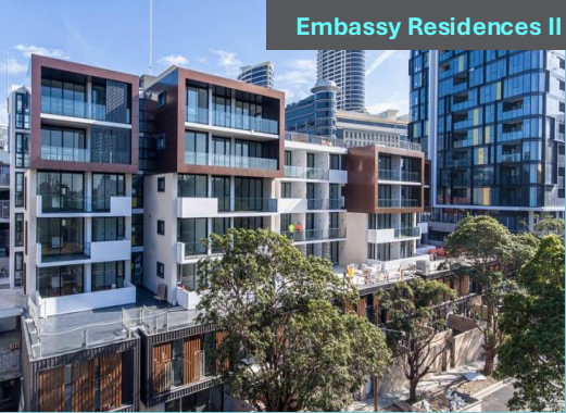
Embassy Residences II